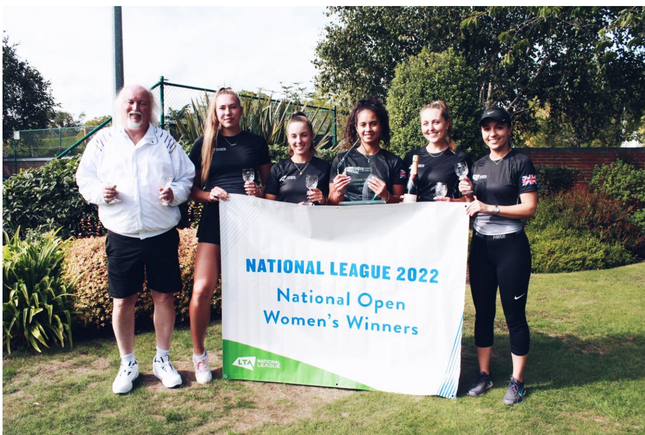
Sutton Tennis & Squash Club (Surrey) – National Open Women's Winners 2022

2022 – Sutton Tennis & Squash Club beat Roehampton Club