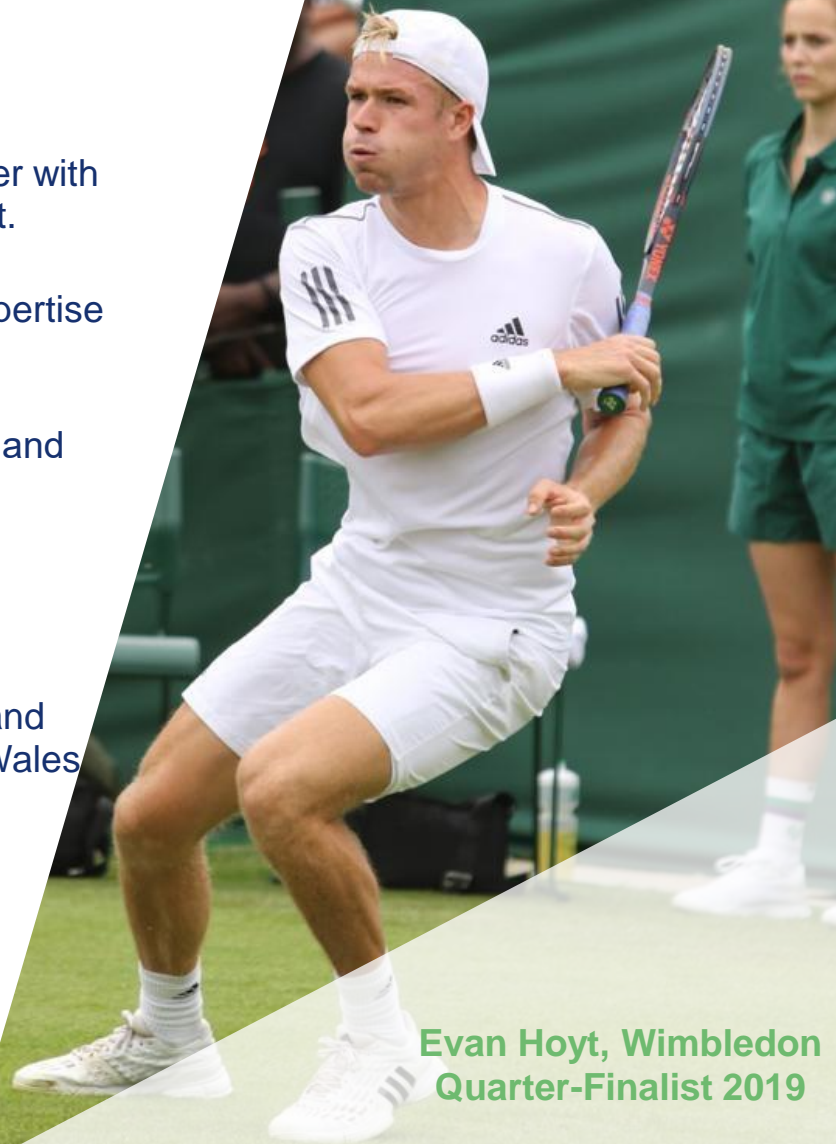
Evan Hoyt, Wimbledon Quarter-Finalist 2019