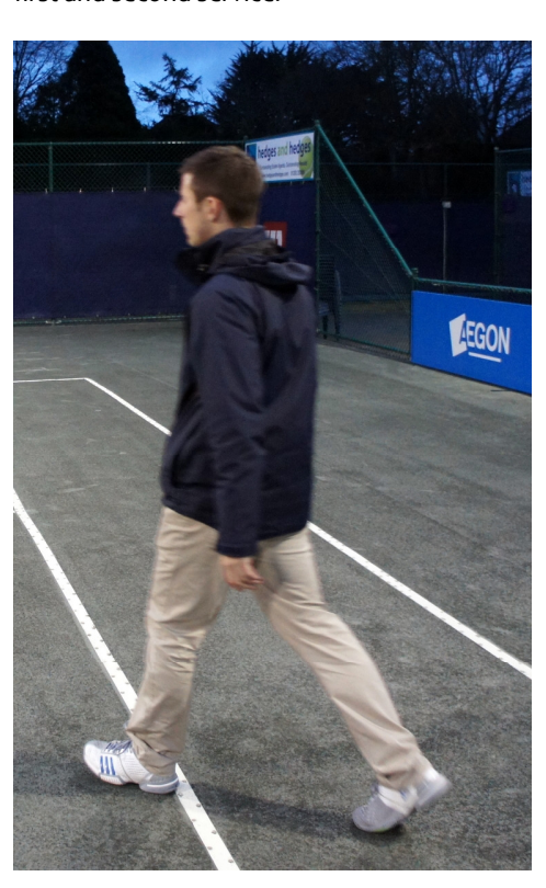
LOCATING MARK Point to the mark. This indicates to the players what mark you are reading.

Quick as possible, but do not sprint. This is most important to avoid a long delay between first and second service.