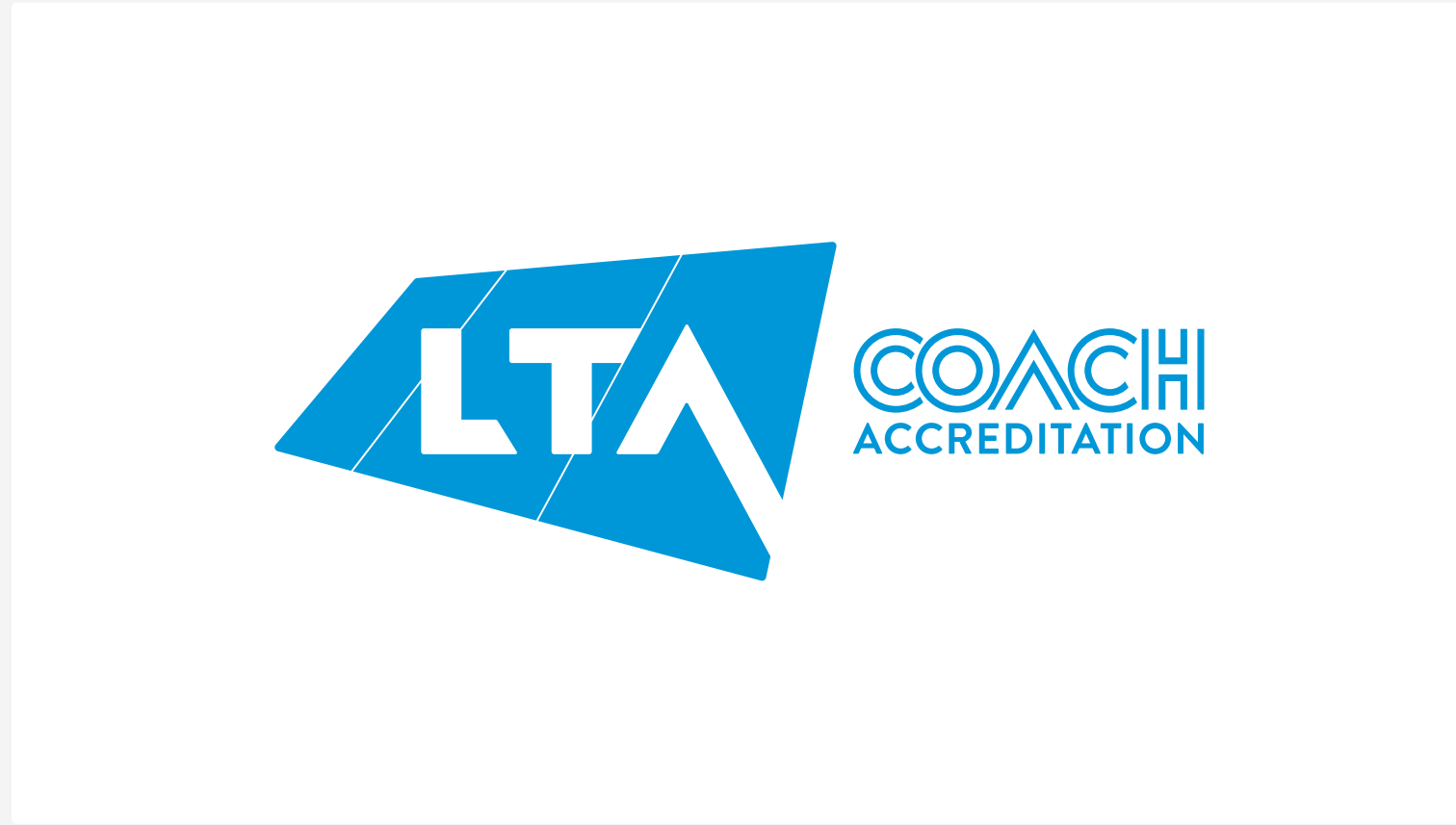
✓ Blue logos can only be put on top of white or very light backgrounds