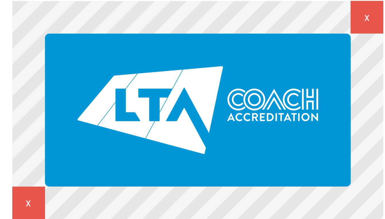
Framed logo clear space